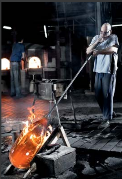
The simultaneous turning and blowing of the glass balloon produces the typical slight or more pronounced distortions in the glass surface.