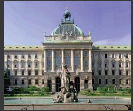
Palace of Justice, Munich, administrative and courthouse building from the late 19th century; restauro® ISO with restauro® Light 3mm; installation 2013/2014