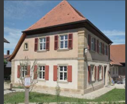
Historical building from the 18th and 19th century in Scheßlitz near Bamberg; restauro® ISO with restauro® Classic 3mm in a 3-10-3 construction; installation 2012