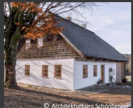
Waldlerhaus in Stadlern; one of the last typical farmhouses of the Bavarian and Upper Palatinate Forest; renovation distinguished with a monument award; window glazing consisting of restauro® ISO with restauro® Light 3mm in a 3-4-3 construction; installation 2016