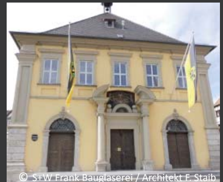
Town hall of Eibelstadt near Würzburg; restauro® ISO with restauro® Light 3mm in a 3-4-4 construction with lead lines applied to the outside; installation 2016/17