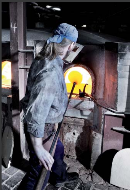
The take-up of the viscous glass mass on the blowpipe.

Cut open on both ends, the result is a glass cylinder which is slowly cooled, then cut lengthwise, and flattened after being heated once again.